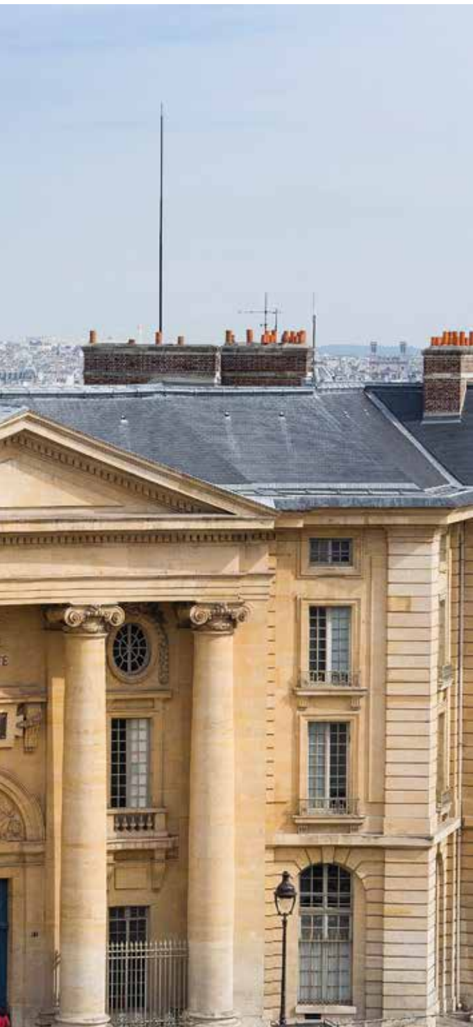
VIEW OF THE PANTHEON SORBONE UNIVERSITY